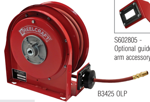
S602805 - Optional guide arm accessory